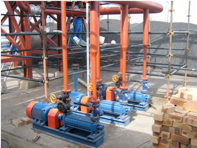
Pump installation at a site

UHS has the facilities to site establish i.e. portable office and accommodation for the key on site supervisors, planners, quality controllers and safety supervisors to ensure that project is managed closely.