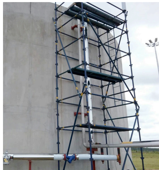
Steam (Carbon steel) and gas line (Stainless steel) installation at the new water treatment plant in Matsapha. Including the lagging and cladding of steam line.