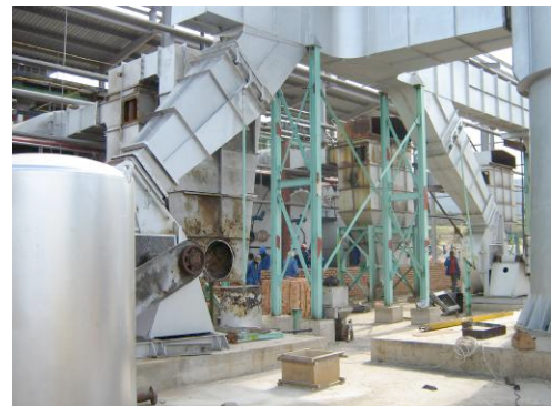
Boiler ducting installation