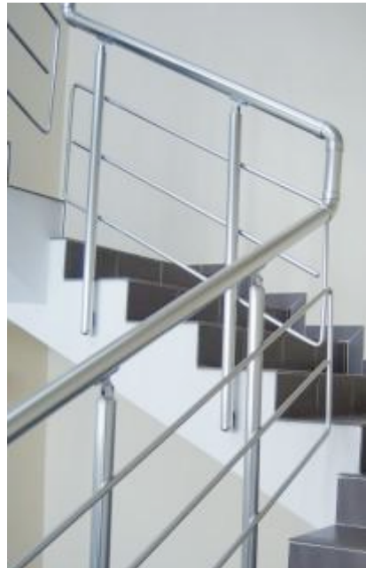
Handrails Fabrication and Installation (domestic and Industrial)