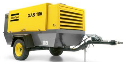
Mobile Cranes, Lowbeds and Air Compressors