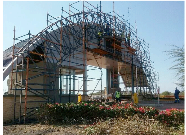
Arch installations for the SADC 2015 Summit at various places in the country